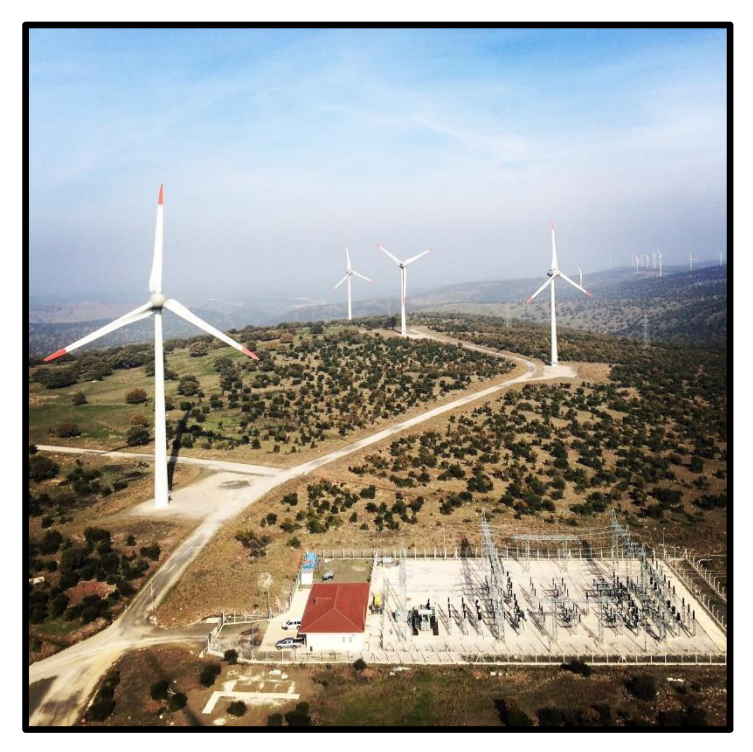
Figure 1. Example photos of wind turbines and switchyard